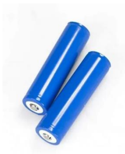
Figure 2: Battery 1,5 V AA

Seven products (HV1E, HV1E2, HV1EN, HV1EN2, HV1EN-150, HV1E-150, and HV1E2-150) are calculated in six different surface groups (16 and 20, 19, 40, 27, 60, 64), see Figure 1 and Figure 2.