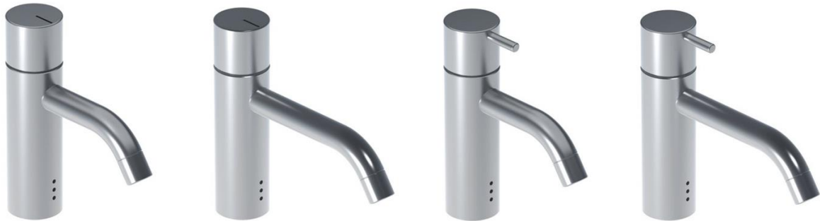
Figure 1: HV1E & HV1EN, HV1E/150 & HV1EN/150, HV1E2 & HV1EN2, and HV1E2/150